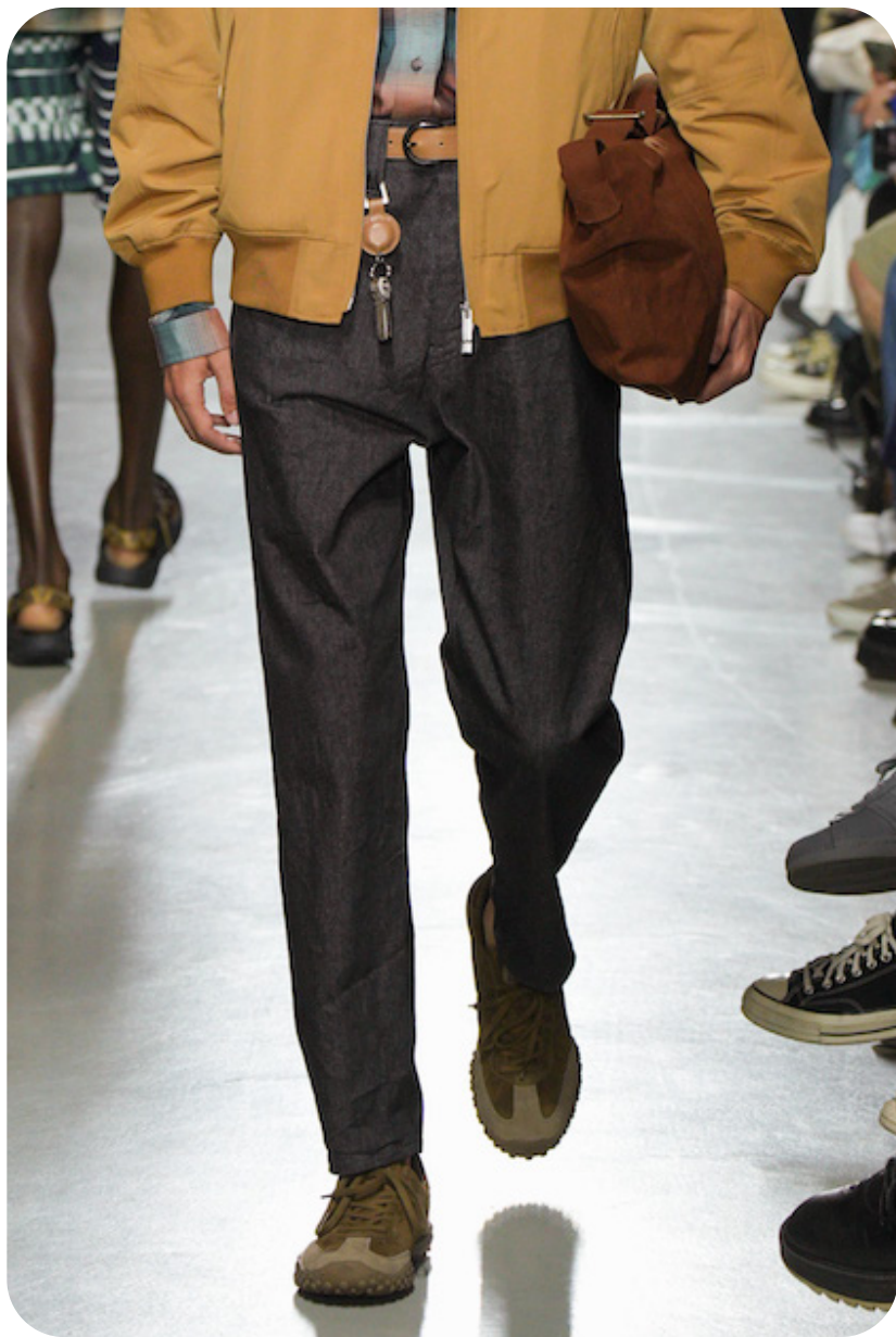
White Mountaineering 9.jpg