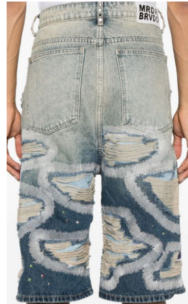
who decides war.jpg