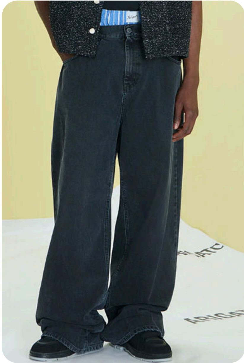
Axel Arigato 3.png