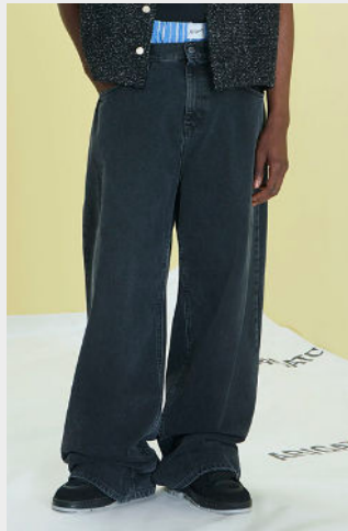
Axel Arigato 3.png