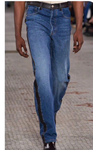
Wales Bonner 50.jpg