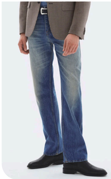
Tiger of Sweden.png