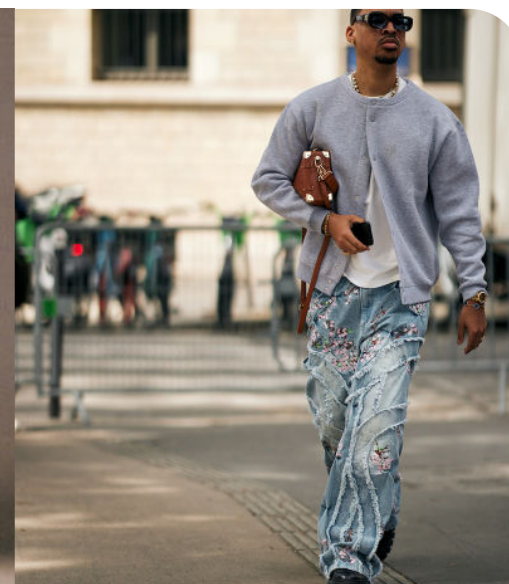
streetstyle paris ss25