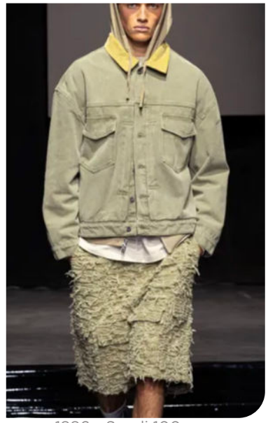
1886 - Saudi 100.png