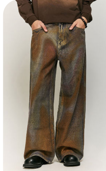
@vanci-digital printed .jpg