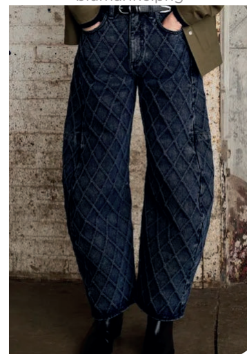
Rag & Bone7.png