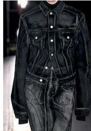
alain paul -1.jpg