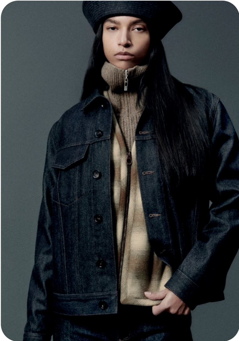
loro piana -12.png