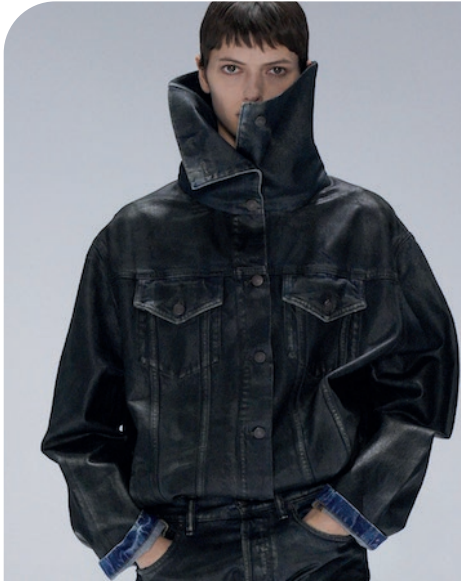
acne studios -3.jpg