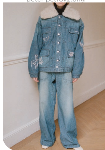
sea ny -1.png