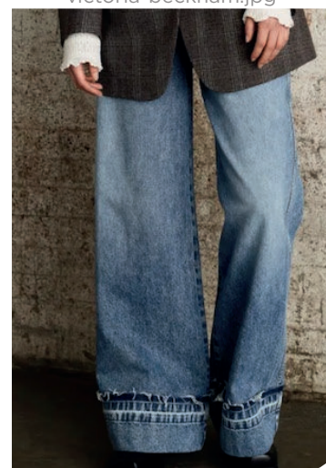
Rag & Bone1.png