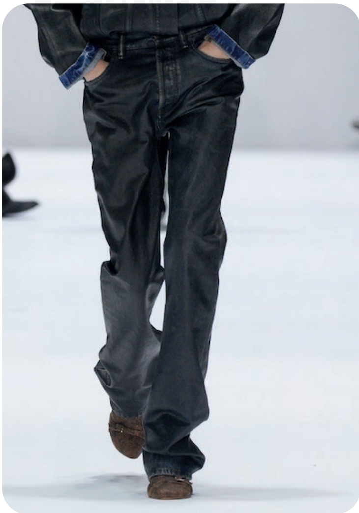
acne studios -3.jpg