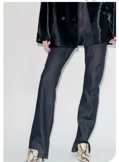
teurn studio -5.png