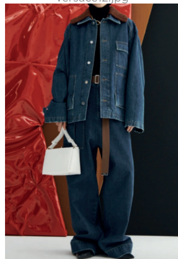
Plan C -8.png