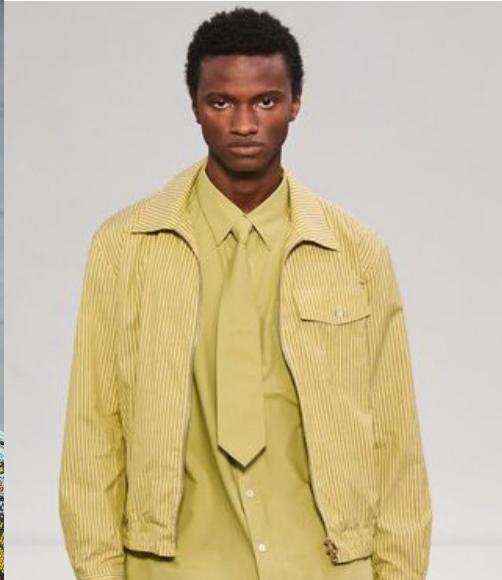
paul smith SS24.jpeg