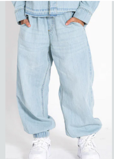
finger in the nose.webp