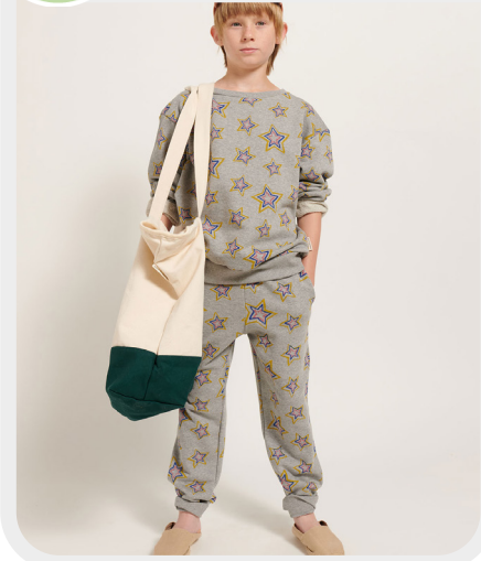
weekend house kids.jpeg