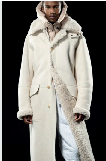
Woolrich Black Label_9.png