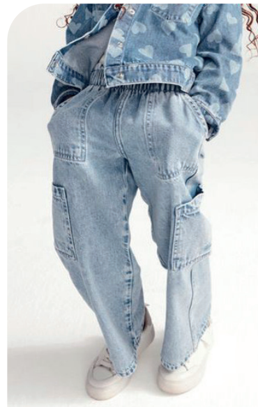
Tribe Talent Management.jpg