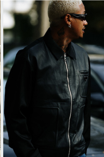
Paris Streetstyle - 234.jpg