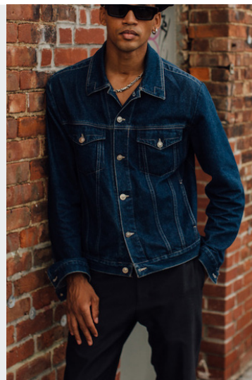
New York Streetstyle - 192.jpg