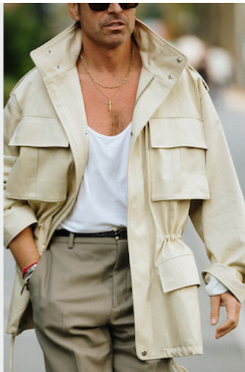
Paris Streetstyle - 227.jpg