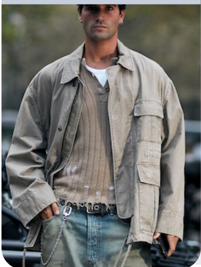
Paris Streetstyle - 283.jpg