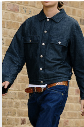
London Streetstyle - 117.jpg