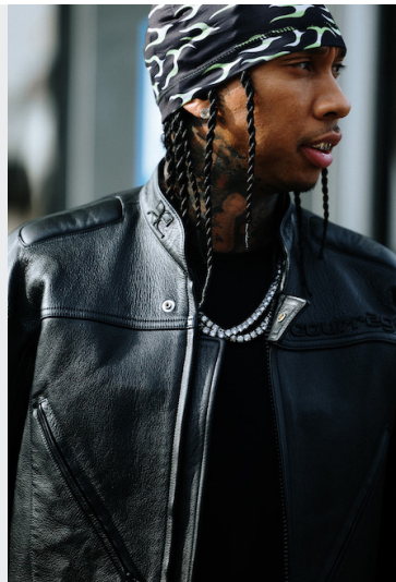
Paris Streetstyle - 236.jpg