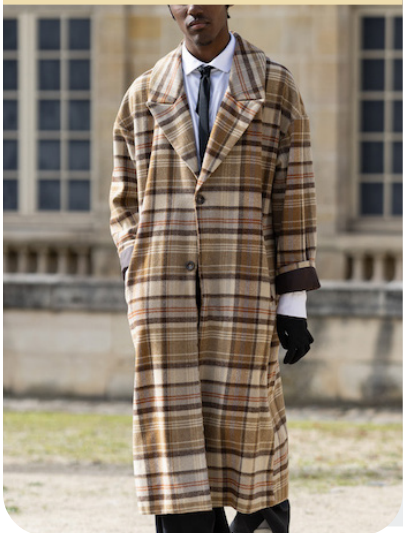
Paris Streetstyle - 74.jpg