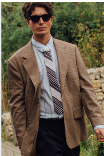
London Streetstyle - 200.jpg