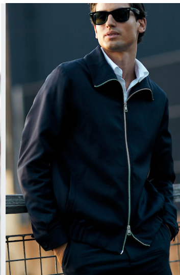
New York Streetstyle - 254.jpg