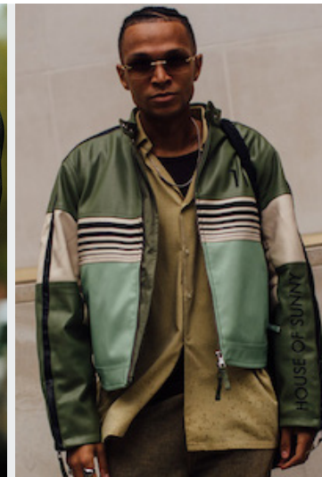
London Streetstyle - 316.jpg