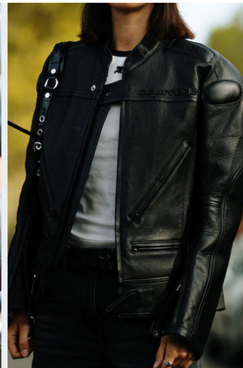
Paris Streetstyle - 230.jpg