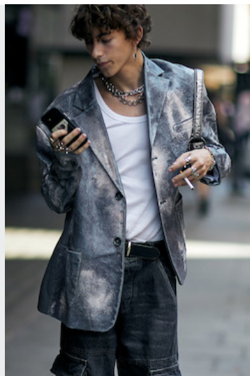
London Streetstyle - 78.jpg