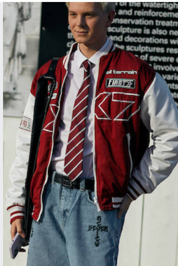
Paris Streetstyle - 445.jpg