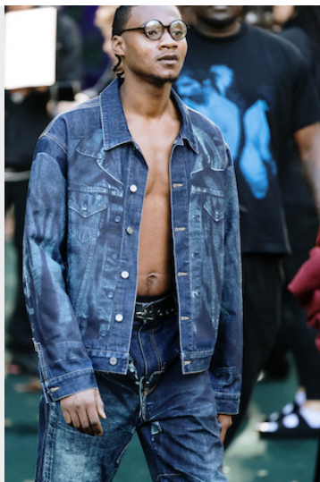
London Streetstyle - 281.jpg