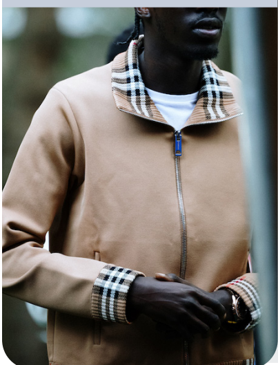
London Streetstyle - 268.jpg