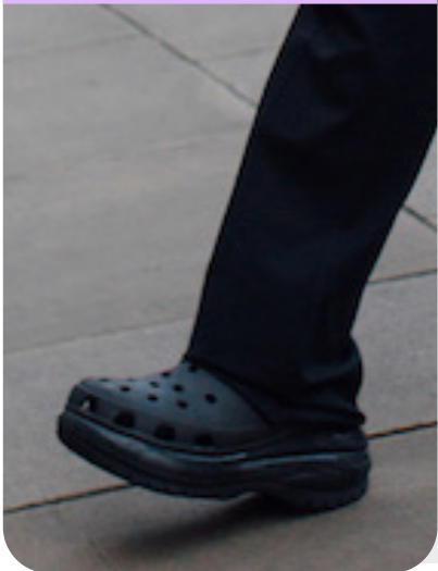
London Streetstyle - 212.jpg