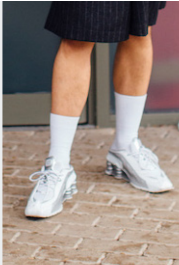
London Streetstyle - 206.jpg