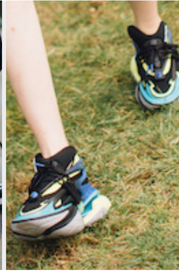
London Streetstyle - 259.jpg