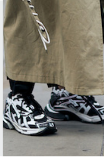
London Streetstyle - 282.jpg