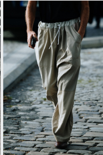
Paris Streetstyle - 231.jpg