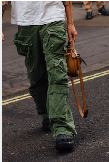
London Streetstyle - 93.jpg