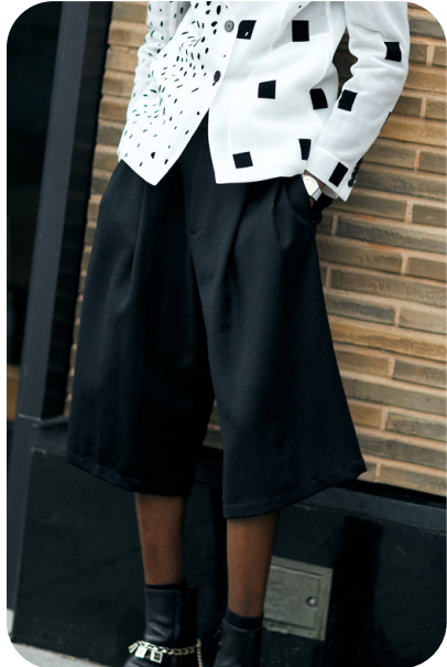
New York Streetstyle - 65.jpg