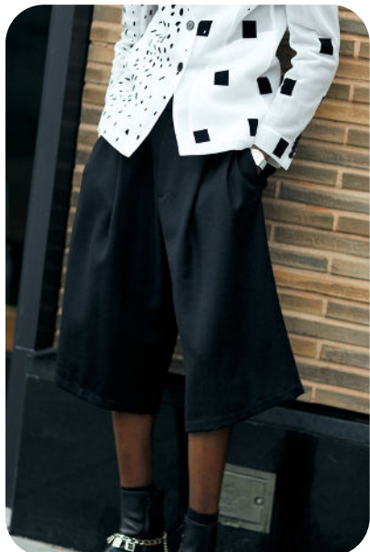
New York Streetstyle - 65.jpg