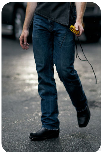
New York Streetstyle - 72.jpg