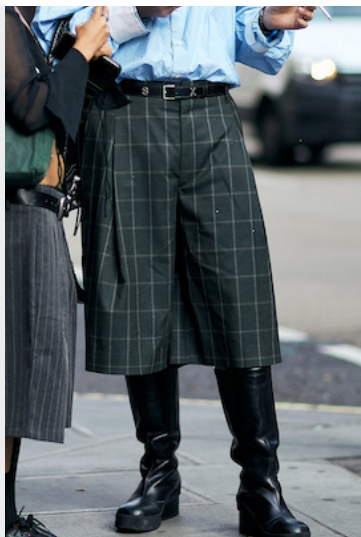
London Streetstyle - 65.jpg