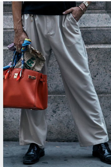
New York Streetstyle - 11.jpg