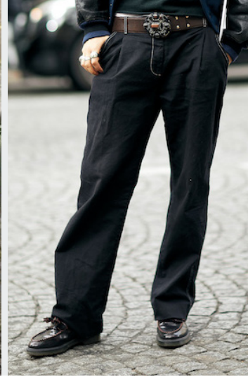
Paris Streetstyle - 382.jpg