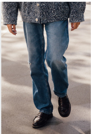
Paris Streetstyle - 240.jpg