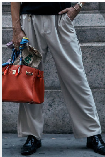
New York Streetstyle - 11.jpg